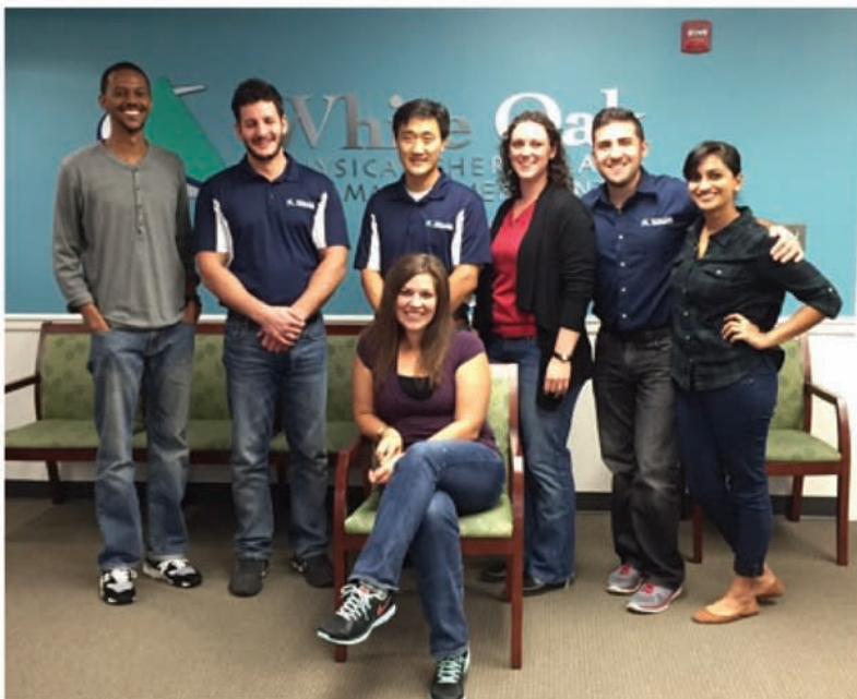
White Oak PT, home of our CI of the year for the class of 2015.

Scheduling for the 2017 Student placements has begun as of March 1 st ! Dates for upcoming internships: